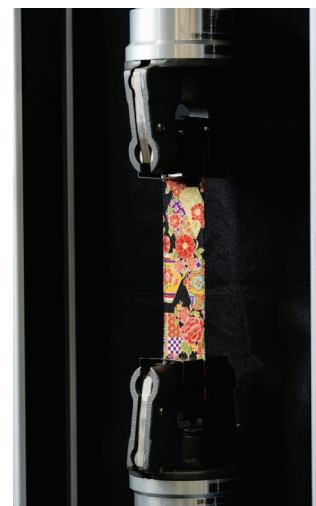
Fig. 2 Photo of the Test