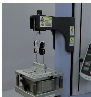
Fig. 2 Picture of the Test (Milk Membrane)